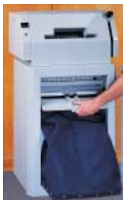
Self sealing transport bag