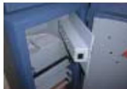
Lockable deposit compartment combined with other interior fittings