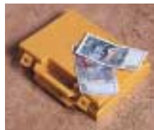
Deposit cassette C1