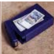
Lockable deposit cassettes C2