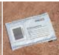
Deposit envelope A5